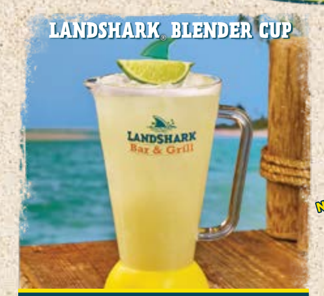
ENJOY YOUR SPECIALTY DRINK OR DRAFT BEER IN A 22 OZ TAKE-HOME LANDSHARK® SOUVENIR BLENDER CUP